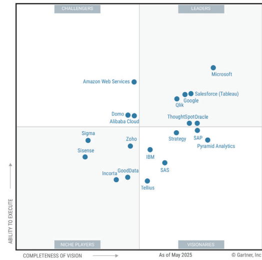
Figure 1: Magic Quadrant for Analytics and Business Intelligence Platforms

Our solution eliminates delays and manual reporting by leveraging Kyriba’s OpenAPI, allowing treasury data to flow securely into Power BI dashboards in minutes.